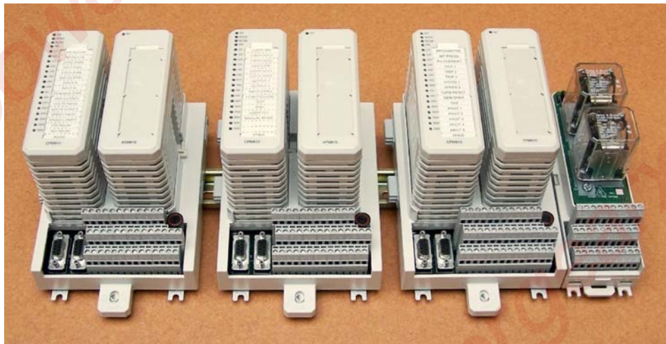
ABB Inc. Business Unit Power Generation