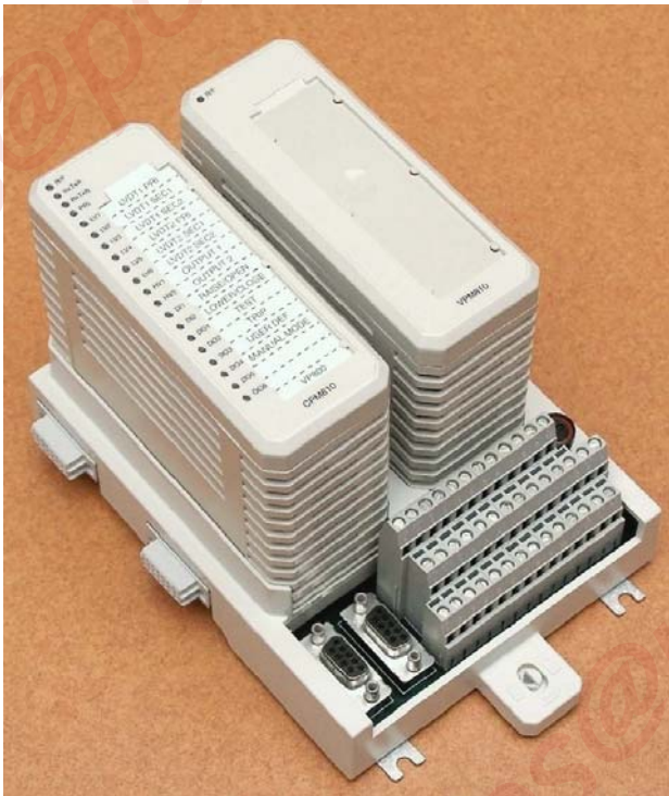
VP800 (CPM810 + VPM810 + TBU810)